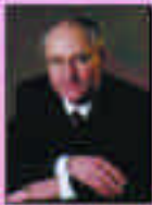
Hon. Wayne Easter Solicitor General, Canada

Mr. Easter became Solicitor General of Canada in October 2002. First elected in 1993, he represents the riding of Malpeque in Prince Edward Island. He has been Chair of the House Standing Committee on Fisheries and Oceans, and Parliamentary Secretary to the Minister of Fisheries and Oceans.