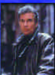
John Walsh Fox TV's "America's Most Wanted, America Fights Back"