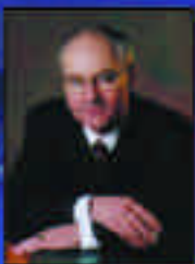
Hon. Wayne Easter Solicitor General, Canada