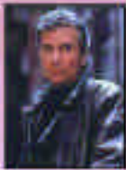
John Walsh America's Most Wanted