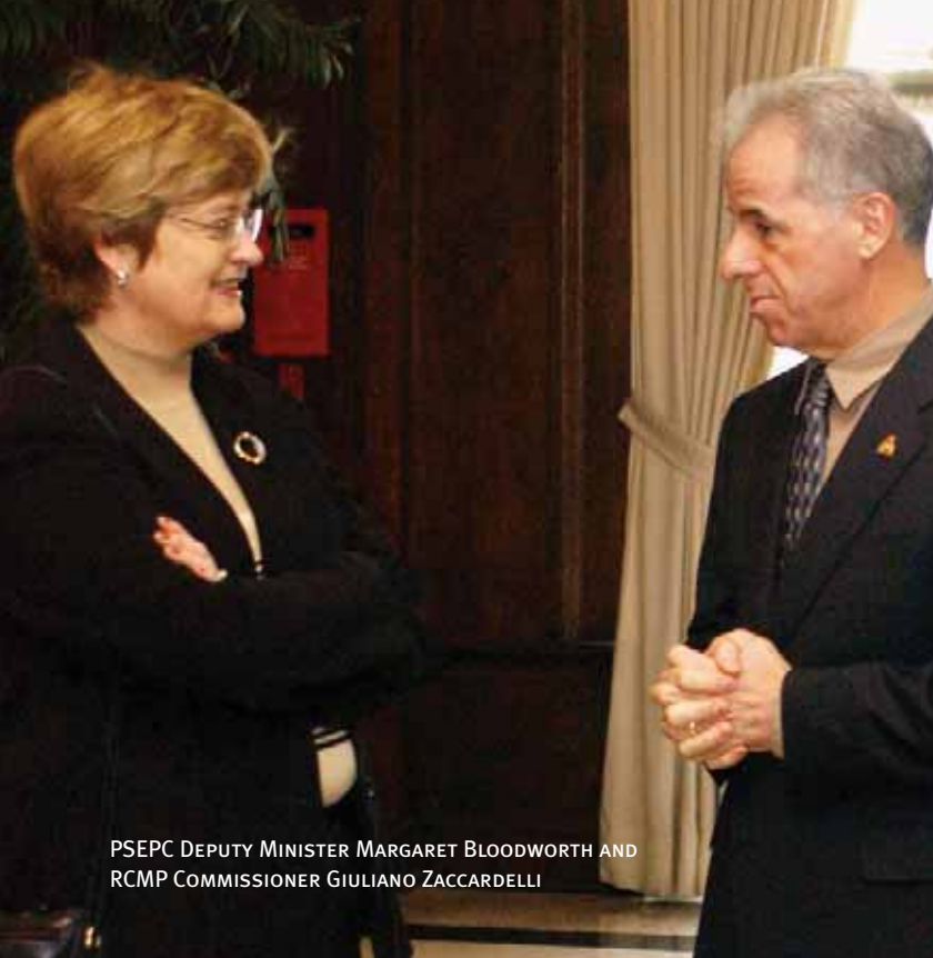
PSEPC DEPUTY MINISTER MARGARET BLOODWORTH AND RCMP COMMISSIONER GIULIANO ZACCARDELLI