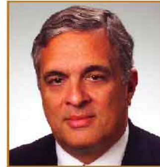
George J. Tenet Former CIA Director United States of America

George John Tenet was sworn in as the 18th Director of Central Intelligence on July 11, 1997, following a unanimous vote by both the Senate Select Committee on Intelligence and the full Senate. In this position, he led the United States Intelligence Community, a team of 14 foreign intelligence organizations, and presided over the daily activities of one of its members, the Central Intelligence Agency.