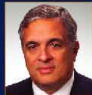
George J. Tenet