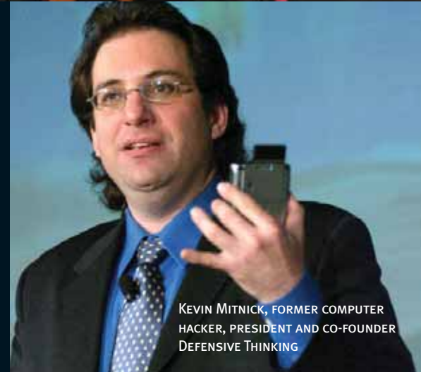
KEVIN MITNICK, FORMER COMPUTER HACKER, PRESIDENT AND CO-FOUNDER DEFENSIVE THINKING

Highlights from the annual international conference on technology and counter-terrorism