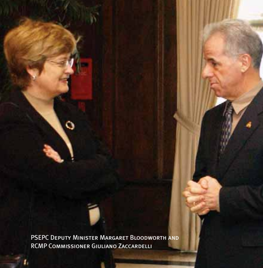
PSEPC DEPUTY MINISTER MARGARET BLOODWORTH AND RCMP COMMISSIONER GIULIANO ZACCARDELLI