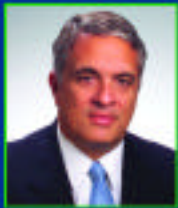
George J. Tenet former CIA Director United States of America

George John Tenet was sworn in as the 18th Director of Central Intelligence on July 11, 1997, following a unanimous vote by both the Senate Select Committee on Intelligence and the full Senate. In this position, he led the United States Intelligence Community, a team of 14 foreign intelligence organizations, and presided over the daily activities of one of its members, the Central Intelligence Agency.