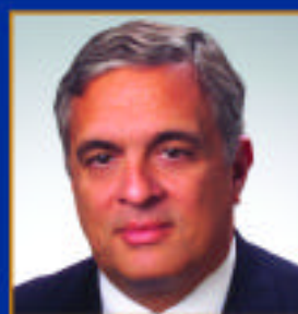
George J. Tenet Former CIA Director United States of America